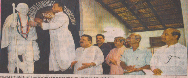
ಬಾವುಟಗುಡ್ಡೆಯ ಪ್ರತಿಷ್ಠಾಪನದ ಕಾರ್ಯಾಲಯದಲ್ಲಿ ಗಾಂಧಿ ಪುಣ್ಯ ತಿಥಿ ನಡೆಯಿತು.