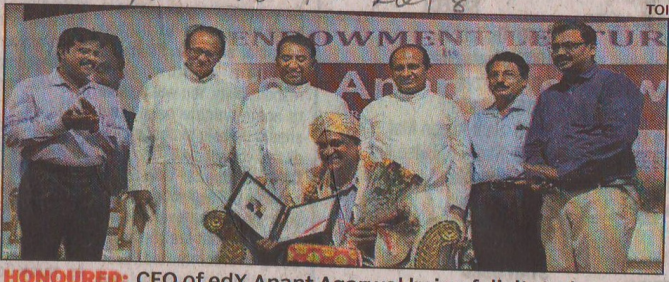
HONOURED: CEO of edX Anant Agarwal being felicitated

The alumnus of the St Aloysius College, Agarwal, delivered an 'endowment lecture' on Monday, on the topic, 'Digital education transformation'. He emphasized the need to scale up the workforce, to cater to the needs of transforming job trends in the future. He introduced three important trends in the future of education being—modular