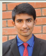
NESARA H S