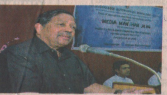
Former Karnataka Lokayukta Justice N Santosh Hegde at St Aloysius college on Tuesday.

"The voice of poor, exploited and suppressed should always be upheld," he