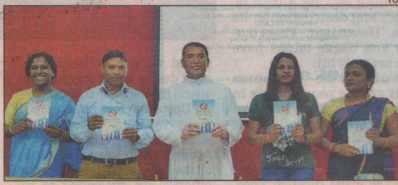
FIGHTING FOR RIGHTS: The activist said transgenders in the state has decided to appeal to the state government to set up district-level cells for the implementation of The Karnataka State Policy on Transgenders, 2017

She was speaking at the release of, 'Domestic and Sexual Violence: Claiming Voice, Rights and Dignity - A Gender Non-Conforming, Trans-