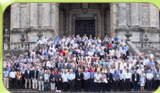
Conference Participants in Bilbao (outside the Sanctuary of Loyola)

Presided by the King of Spain, Felipe VI; the president of the Basque Government, Iñigo Urkullu; and the Father General of the Society of Jesus, Arturo Sosa SJ