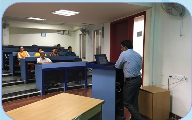
table of contents, list of tables/figures of a thesis/ research report with the help of reference tab of Microsoft word document. Finally, he showed how to remove the page number/s from the cover pages/s of a Microsoft word document. The faculty members of the AIMIT-MBA actively participated in the interaction by contributing their views, opinions and asking queries.