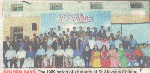
GOLDEN DAYS: The 1989 batch of students at St Aloysius College