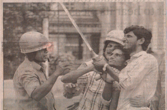
Students of St Aloysius college, Mangaluru, attempt to douse a fire with the help of the Karnataka State Fire and Emergency Services Department.