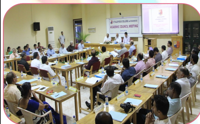
Table Agenda if any