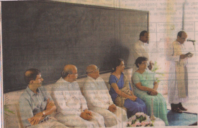
A counselling centre to redress the grievances of the public and students, 'Listening centre', was inaugurated at the St Aloysius high school premises in Mangaluru on Thursday